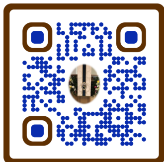
Lay Reader Training