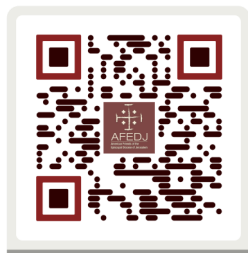
Webpage with Video