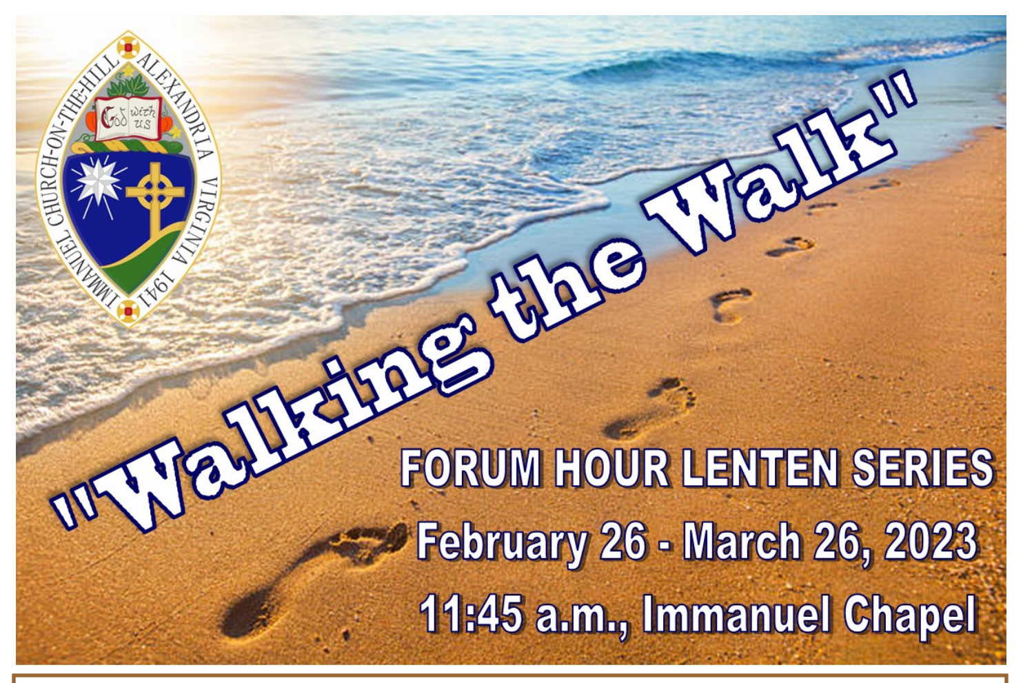
Walking the Walk: A Lenten Series

"Walk in the way of love, just as Christ loved us..." ~ Ephesians 5:2