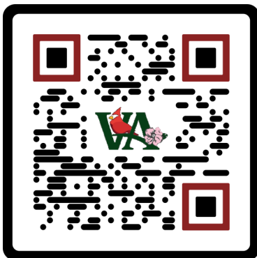
Voter Registration Training

Voter registration for residents of other states: If you want to check your status, or register, to vote in another state where you reside, you can locate appropriate dates and information here.