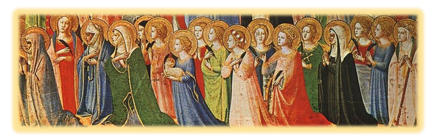
THE WORD OF GOD