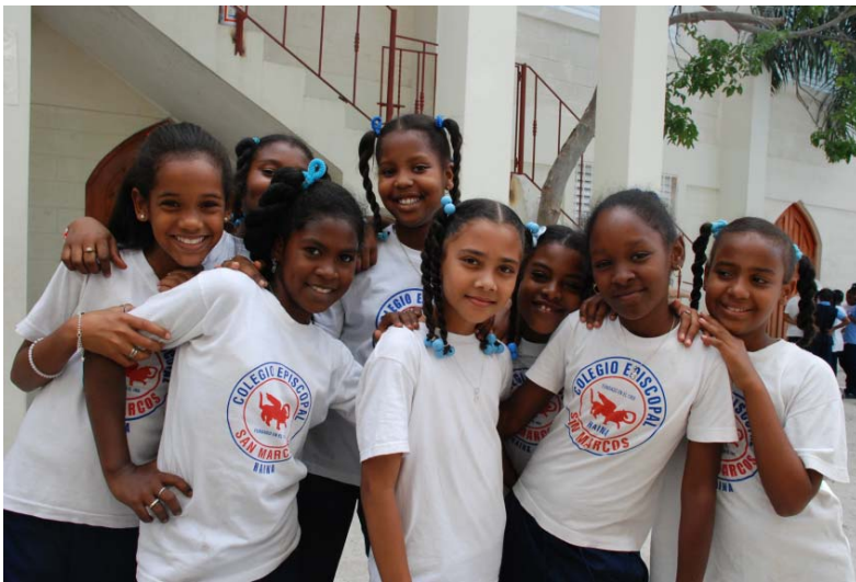
Enthusiastic students at San Marcos School in Haina

For more information on the Dominican Episcopal Church, there are two short YouTube videos at http://www.youtube.com/watch?v=TKlh5NaLZIA and http://www.youtube.com/watch?v=oQ0p0RfCeus&feature=related .