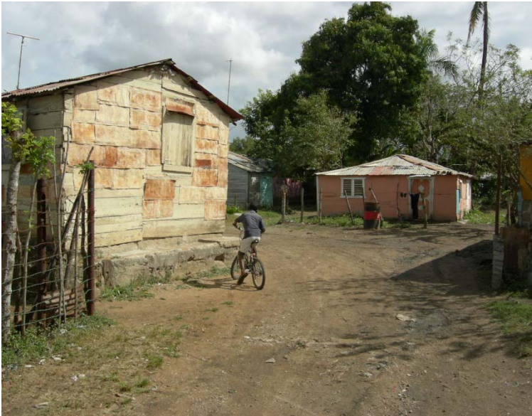
Rural poverty is rampant in Angelina where we have a mission church

Dominican Episcopal Church is indeed dynamic in its growth. In the last 10 years, the Diocese of the Dominican Republic has nearly doubled the number of its churches and congregations to almost 70. In addition, there are 27 Episcopal schools providing some of the best elementary and secondary education in the country. Many factors account for this growth but a primary reason is that the church stresses outreach to the poor. In the Dominican Republic, 42% of the people live below the poverty level; 20% of Dominicans live on one dollar a day or less per person; and 56% do not go beyond 8th Grade.