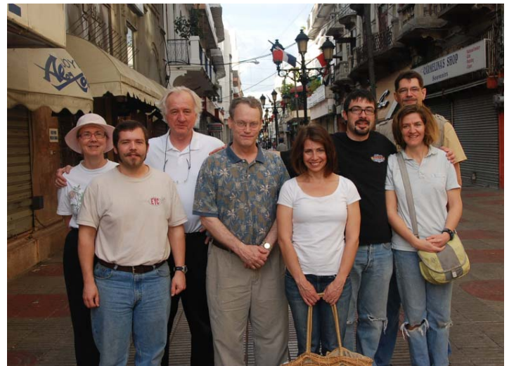
Our Mission Team in 2010