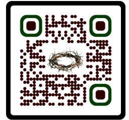
Altar of Repose

If you can help us keep watch by staying in the Oratory Chapel in Immanuel for one hour during the Overnight Prayer Vigil, Maundy Thursday, April 17 , please scan the code at right. Simply stop, pray and keep watch during the night until 12noon Good Friday.