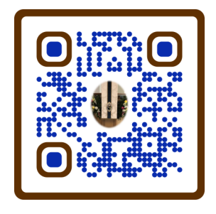
Lay Reader Training