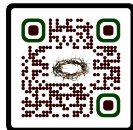
Altar of Repose

If you can help us keep watch by staying in the Oratory Chapel in Immanuel for one hour during the Overnight Prayer Vigil, Maundy Thursday, April 17 , please scan the code at right. Simply stop, pray and keep watch during the night until 12noon Good Friday.