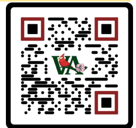
Voter Registration Training

Voter registration for residents of other states: If you want to check your status, or register, to vote in another state where you reside, you can locate appropriate dates and information on the VA elections website.