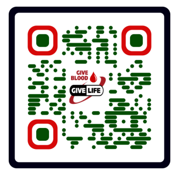
SCAN to Schedule Donation

Blood drives are a meaningful way to help our community—one in seven people entering the hospital need blood and a single car accident victim can require as many as 100 pints of blood. The blood from our drive will likely be used within 48 hours after it ends. Please see recently updated eligibility guidance <u>on Inova's site here</u> and <u>on the FDA's site here</u>. If you are not eligible to donate, please consider <u>volunteering at the registration table</u>—even helping out for an hour would help! If you are considering donating for the first time, Inova has some helpful information<u>here</u>. Please contact Katherine with any questions or to express interest in volunteering. Thank you!