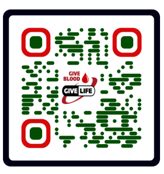
SCAN to Schedule Donation

Blood drives are a meaningful way to help our community-one in seven people entering the hospital need blood and a single car accident victim can require as many as 100 pints of blood. The blood from our drive will likely be used within 48 hours after it ends. Please see recently updated eligibility guidance on Inova's site here and on the FDA's site here. If you are not eligible to donate, please consider volunteering at the registration table-even helping out for an hour would help! If you are considering donating for the first time, Inova has some helpful information here. Please contact Katherine with any questions or to express interest in volunteering. Thank you!