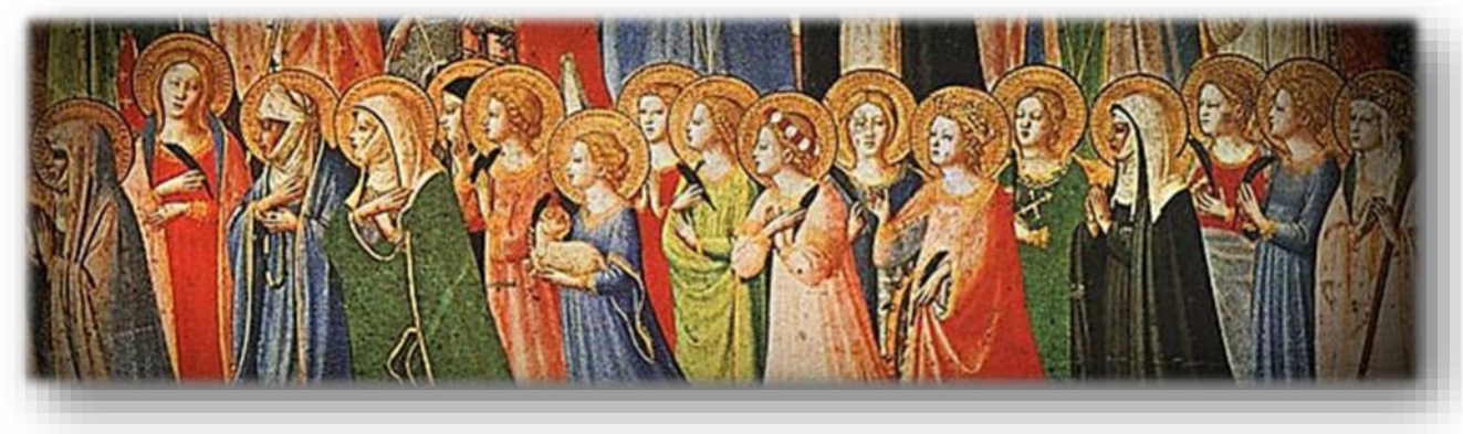
The Word of God

The Celebrant: Blessed be God: Father, Son, and Holy Spirit People: And blessed be God's kingdom, now and for ever. Amen.