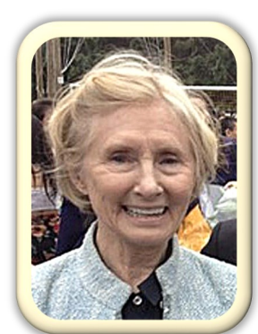
Click on photo for her obituary.

followed by Reception in the Parish Hall