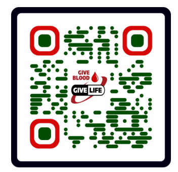
SCAN to Schedule Donation

Blood drives are a meaningful way to help our community—one in seven people entering the hospital need blood and a single car accident victim can require as many as 100 pints of blood. The blood from our drive will likely be used within 48 hours after it ends. Please see recently updated eligibility guidance on Inova's site here and on the FDA's site here. If you are not eligible to donate, please consider volunteering at the registration table—even helping out for an hour would help! If you are considering donating for the first time, Inova has some helpful information here. Please contact Katherine with any questions or to express interest in volunteering. Thank you!