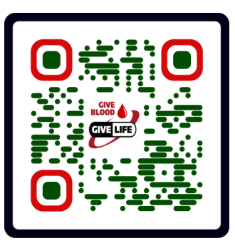
SCAN to Schedule Donation

Blood drives are a meaningful way to help our community-one in seven people entering the hospital need blood and a single car accident victim can require as many as 100 pints of blood. The blood from our drive will likely be used within 48 hours after it ends. Please see recently updated eligibility guidance <u>on Inova's site here</u> and <u>on the FDA's site here</u>. If you are not eligible to donate, please consider <u>volunteering at the registration table</u>-even helping out for an hour would help! If you are considering donating for the first time, Inova has some helpful information<u>here</u>. Please contact Katherine with any questions or to express interest in volunteering. Thank you!