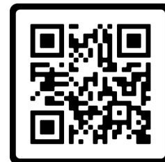
Scan for Webinar 12-17-24