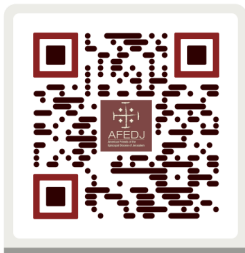
Webpage with Video