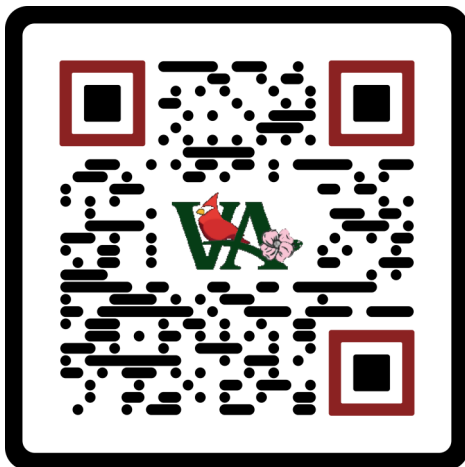
Voter Registration Training

Voter registration for residents of other states: If you want to check your status, or register, to vote in another state where you reside, you can locate appropriate dates and information here.