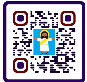
Godly Play Registration