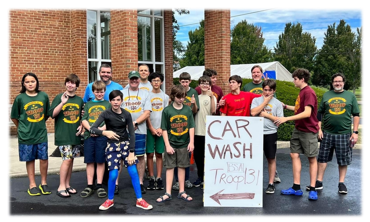
Troop 131 Car Wash Fundraiser At Zabriskie September 9^{th}

Please help support Immanuel's own Scout BSA Troop 131! Troop 131 Car Wash Fundraiser Saturday, September 9<sup>th</sup> 9 AM to 2 PM In the Zabriskie Chapel parking lot