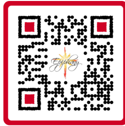
Pageant on YouTube

A hearty thanks to all who participated in making last Sunday's 10:30am service and reception such a joyful celebration! If you weren't with us at 10:30am, the full service is available on our YouTube page — visit by scanning the QR code below.