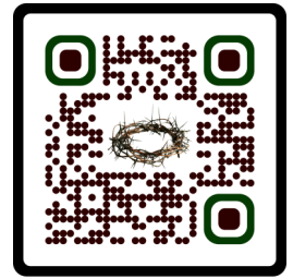
Altar of Repose

We have just four open slots that need to be filled. If you can help us keep watch by staying in the Oratory Chapel in Immanuel for one hour during the Overnight Prayer Vigil, Maundy Thursday, April 17 , please scan the code at right. Simply stop, pray and keep watch during the night until 12noon Good Friday.