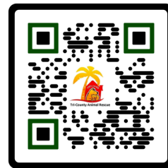
Scan to Donate

21287 Boca Rio Road Boca Raton, FL , USA (561) 482-8110 tricountyanimalrescue.com/