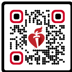
Memorial Gift Link

National Center 7272 Greenville Avenue Dallas, TX 75231 1(800) 242-8721 heart.org